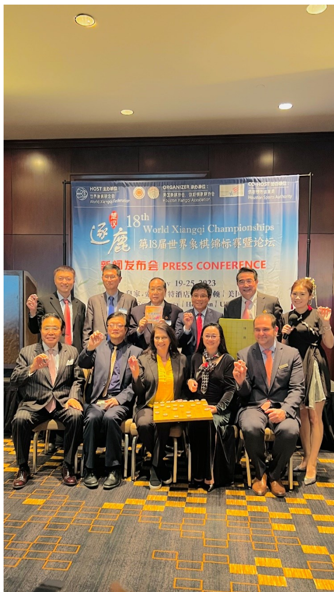
Group photo of 18 th World Xiangqi Championships leaders and VIP guests