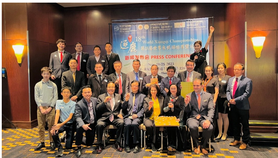
Group photo of leaders, VIPs, Xiangqi players and volunteers