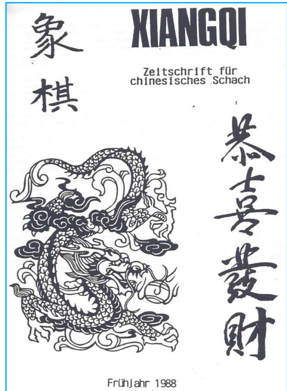
Cover of the Quarterly XIANGQI