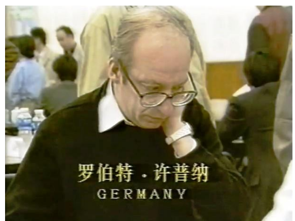
Dr. Robert Huebner, 1980 ranked No. 3 in the world of International Chess